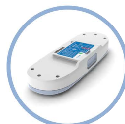
Inogen One ® G3 Single Lithium Ion Battery* Up to 4 hours run time Item #BA300