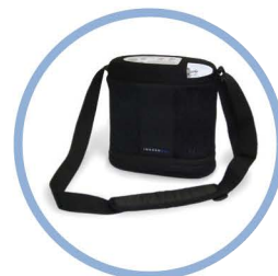
Inogen One ® G3 Carry Bag* Item # CA300