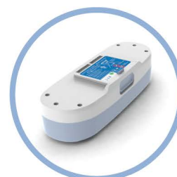
Inogen One ® G3 Double Lithium Ion Battery** Up to 8 hours run time Item #BA316