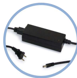
Inogen One ® G3 AC Power Supply* Item # BA300