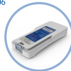
Inogen One ® G4 Lithium Ion Battery* Up to 3 hours run time Item #BA-400

Approximately half the size of the Inogen One G3!