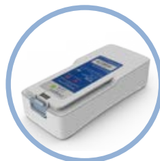
Inogen One ® G4 Extended Life Lithium Ion Battery** Up to 6 hours run time Item #BA-408