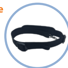
Inogen One ® G4 Carry Strap* Item # CA-401

Approximately half the size of the Inogen One G3!