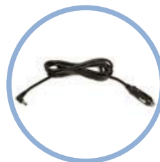
Inogen One ® G4 DC Power Cable* Item # BA-306