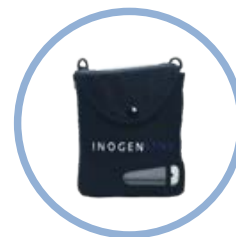
Inogen One ® G4 Carry Bag* Item # CA-400